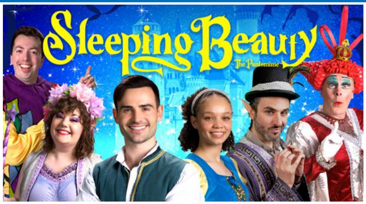
Sleeping Beauty - The Pantomime

Step into a fairy-tale world of magical castles, bewitched spinning wheels and an enchanted sleep that only true love's kiss can break... with stunning sets, mesmerising music and a wicked spell or two, don't miss Worthing's DREAM of a pantomime – Sleeping Beauty: The Pantomime.